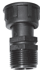
SFAD - 25