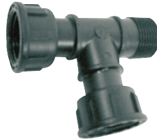
SFTE - 25