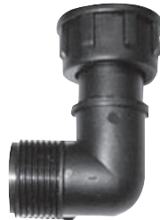
SFEL - 25