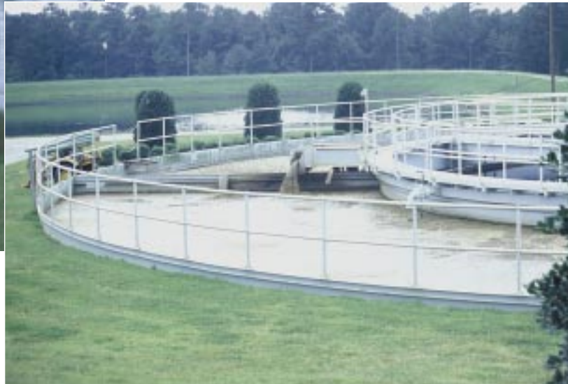
1,500 hp pumps move the wastewater to the land treatment site.

The spray irrigation system is designed as solid set with main lines and laterals installed below the frost line at least 1.64 feet in depth to protect against damage of heavy equipment. Galvanized steel risers approximately 3.6 feet high employ an impact sprinkler for application of the wastewater. Flow control valves have been installed to maintain optimum operating flow of sprinkler units. There are drains installed in the irrigation system, just below ground level, located in the lower lying areas. This enables the water to drain from the risers when freezing temperatures are forecast. Approximately 19,446 sprinklers are used to apply wastewater to the land treatment area.