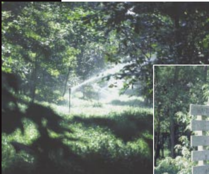
Clayton County Water Authority's E.L. Huie Land Treatment System is over 4,000 acres.