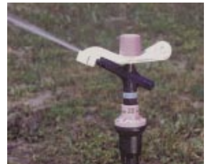
The sprinkler is a Senninger 5023 single nozzle F-luent-Master™, specially designed for effluent solutions.