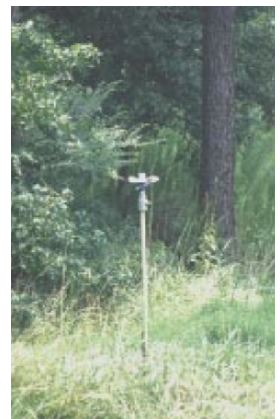
Land treatment using irrigation is a cost effective means of treating wastewater.

Clayton County Water Authority initiated a study in 1974 analyzing wastewater discharge in the basin area. They projected the impact over the next 20 years. Considerations included topography, soil analysis, hydraulic loading, and costs of wastewater treatment options. Land treatment using spray irrigation was identified as a cost-effective means of treating wastewater. In 1980 Clayton county began implementing treated wastewater for irrigation instead of discharging it into the basin.