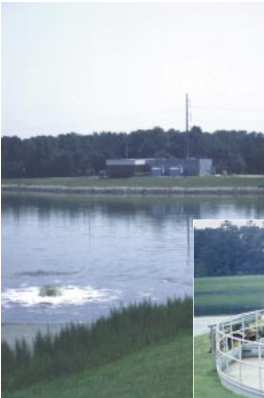
The storage ponds can hold twelve days of design flow (19.5 mgd)

Clayton County Water Authority E.L. Huie Land Treatment System encompasses 4,000 acres. Approximately 2,700 acres are irrigated with 2.52 inches applied per week. Two facilities use activated sludge to pretreat the wastewater. It is then pumped seven miles to the storage ponds. The storage ponds accommodate twelve days of flow from the pre-treatment facility. The 1,500 hp pumps move the wastewater to the land treatment site.