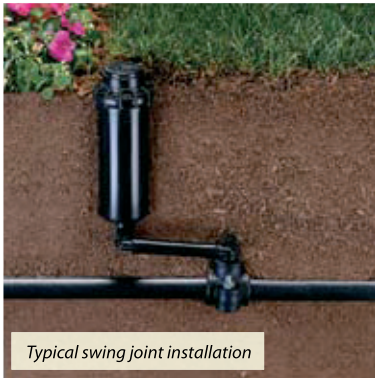
Typical swing joint installation