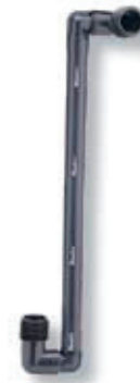
3/4" Threaded x 30 cm Length

H ave you experienced trouble installing sprinklers to the correct finish grade because you can't find the right riser length? When existing pipes are buried in shallow trenches and you want to retrofit to taller pop-up sprinklers, what can you turn to? Are you having difficulty raising sprinklers that are buried under centimeters of built-up thatch? Do you want to be sure that