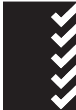
AS2845.1 Lic 1335