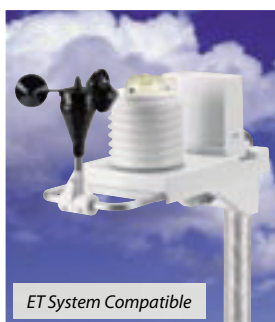
ET System Compatible

If your landscape is a particular one, with its own quirky requirements, the Pro-C is just the controller to handle that little prima donna. No other controller has more flexibility in its programming options. Need multiple daily waterings? How about 3 independent programs and 4 start times per program. Deep soaking needs? The Pro-C offers long station run times. Irrigation restrictions in your area? Choose from day of the week, interval watering, or true odd/even scheduling. There's even an "event day off" feature that designates specified days of the week for non-watering (perfect for regular maintenance or special events).