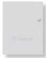
Stainless Steel Cabinet