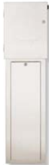
Stainless Steel Pedestal

H unter introduced the concept of personalized construction for controllers—allowing custom tailoring to more effectively handle the odd number of stations a system may require—and the acceptance has been overwhelming. Then again, why shouldn't it be? After all, nothing else makes more sense when seeking the ideal choice to run irrigation systems at virtually any commercial site, from schools, parks, and sports fields to hotels, resorts, and apartment buildings. The idea is a simple one: a controller that's "built" by