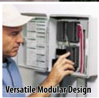
Versatile Modular Design