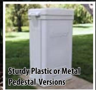
Sturdy Plastic or Metal Pedestal Versions