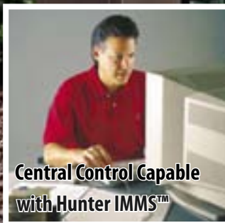
Central Control Capable with Hunter IMMS™