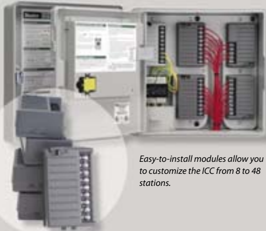
Easy-to-install modules allow you to customize the ICC from 8 to 48 stations.

It's an idea that makes so much sense... while saving you so many dollars. For the professionals who stock and carry controllers, modules make inventory control easy—there's no need to estimate how many of each size controller you need to keep on hand. Now you simply stock modules. And that means, for customers whose systems require a non-standard number of stations, with modules you can customize the controller to the exact needs of the project—even if those needs change as the project grows.