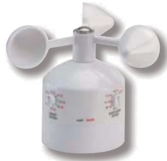
Wind-Clik Wind Sensor

Control irrigation system operation during high wind conditions