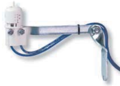
Mini-Clik Rain Sensor

The world's most simple, accurate, rugged, and reliable rain sensors