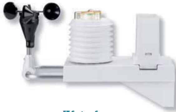
ET System Sensor (Shown with optional ET WIND)

T ake the guesswork out of irrigation scheduling, by tracking your local microclimate and automatically calculating a scientific irrigation program! The Hunter ET System is an easy-to-add-on accessory (for any Hunter controller that operates with a SmartPort® system) that measures key climatic conditions, and uses them to calculate your local Evapotranspiration (ET) factor. The ET is then downloaded into your irrigation controller to create an irrigation program that is just right for your sprinkler system, plants, and soil conditions. By taking into account the rate at which water is consumed