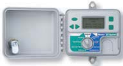
ET System Module

Gathers weather data on site, continuously calculates the ideal program for your landscape